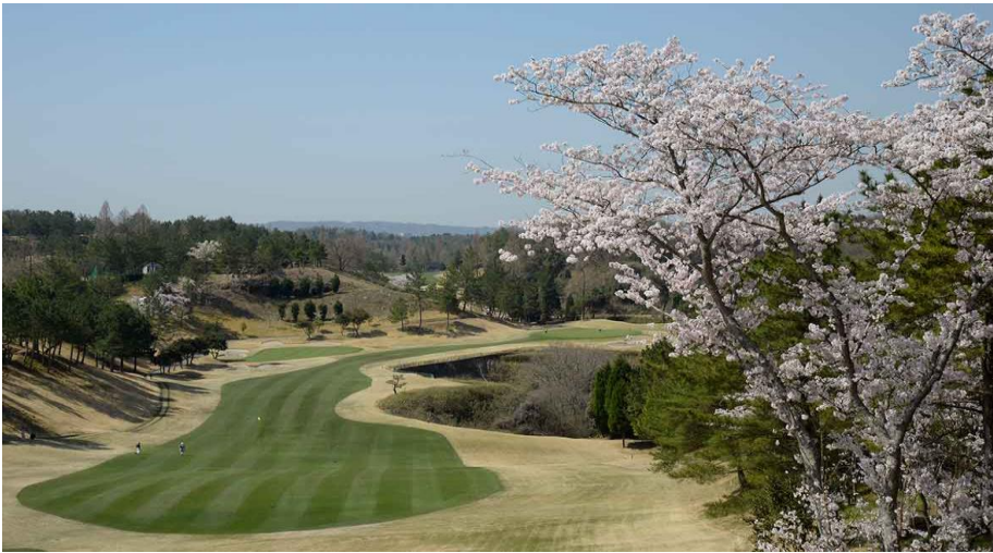
No. 1 Spring season