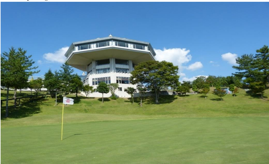
No. 18 Green